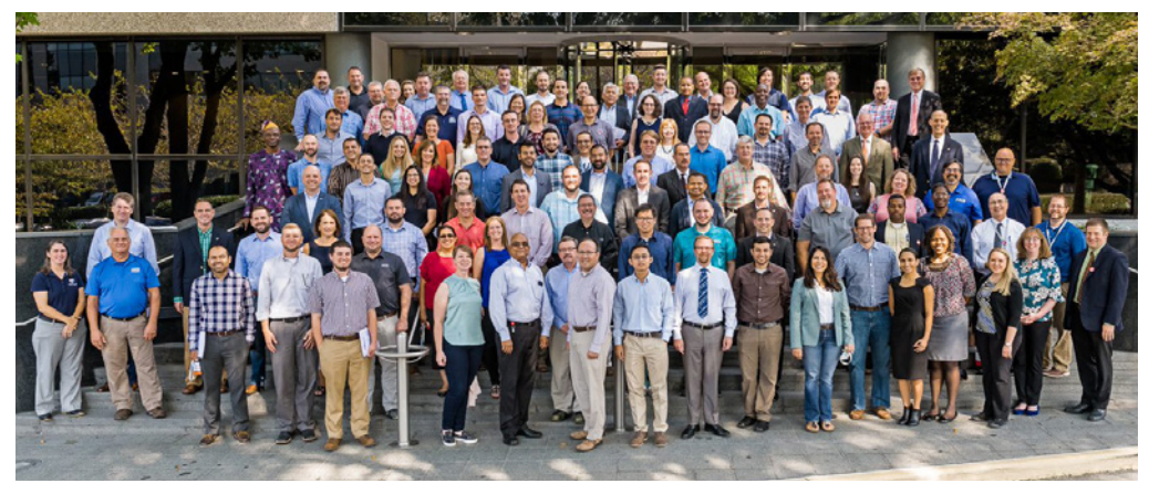
Attendees at the September ASCE Presidents and Governors Forum pose for a photograph outside of ASCE's headquarters.