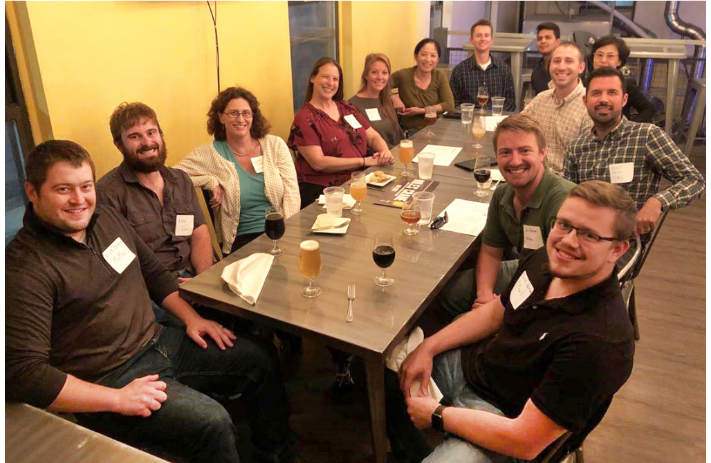
Beaming Geo-Institute group members at the recent brewery social