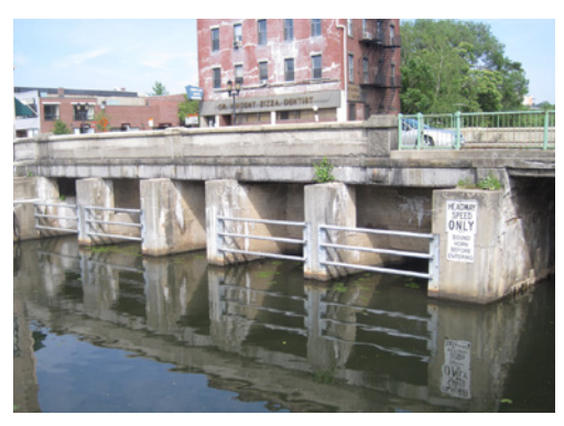
An earlier road widening in the 1920s had obscured the arched spans of the original bridge.

While the bridge is not itself listed on the Historic Register, it is a contributing element to the Medford Historic District. The project