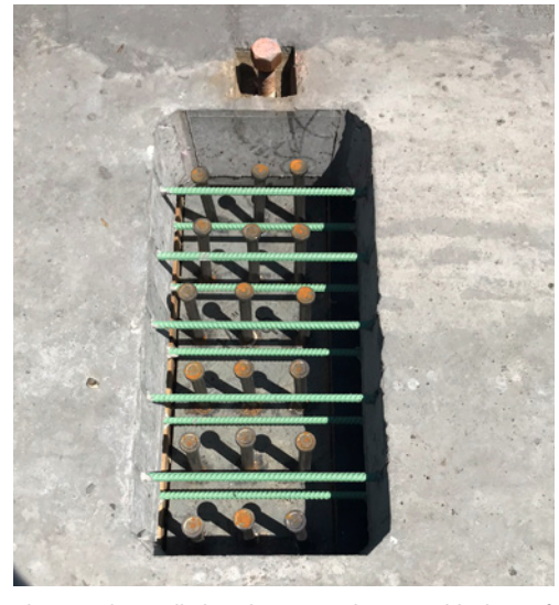
Shear studs installed on the existing beams at blockout of the precast deck panels.

The construction sequence was accelerated to maintain one westbound lane of traffic on the bridge at all times since a City fire station is located on the east side of the bridge. First, the