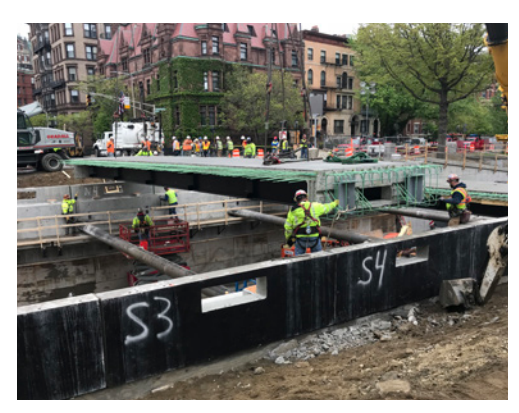
Rapid placement of Prefabricated Bridge Units minimized traffic disruptions.

A unique feature of the crossing is that the deck carries compression from side walls. In effect, the bypass functions as a tunnel section. Therefore, during demolition, without temporary support, existing abutment walls, which by then were strengthened by new cast-in-place (CIP) facing walls, would have to act as cantilever walls from their base. Review of the existing structure indicated that reinforcement was insufficient to provide strength for cantilever behavior. The design package included loads and details for