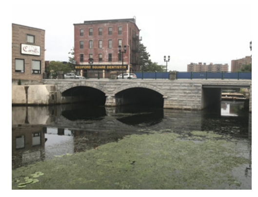
New arch spans and granite on upstream face makes the bridge an attractive component of the adjacent Medford Historical District.

Traffic volumes are very high since Main Street leads into Medford Square with an Annual Average Daily Traffic of approximately 42,000 vehicles. A temporary bridge was constructed to allow for two lanes of rush hour traffic in each direction. The temporary bridge was installed to the east (downstream side) of the bridge and