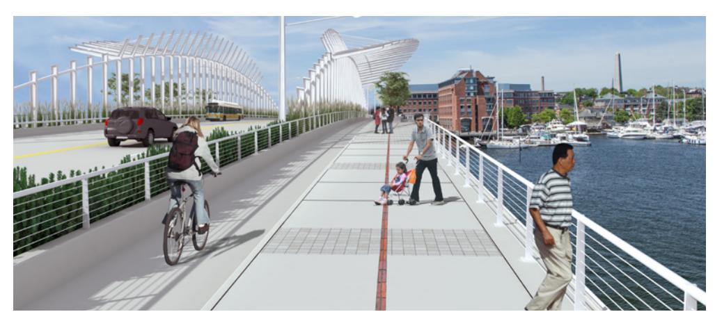
Rendering of bridge design on the pedestrian walkway facing Charlestown end of bridge (Provided by City of Boston– Public Works Department).

The replacement superstructure requires that it be constructed in place and be able to support cantilevers that could be added later to support the sidewalks and the overlooks on the main span. The resulting design consists of four torsionally rigid trapezoidal steel box girders with