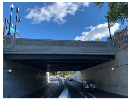
Reconstructed bridge replicated historic design features, while expanding clearance for underpass traffic.

temporary struts to be placed before demolition. Plates were embedded in the CIP-facing walls to accommodate placement of struts.