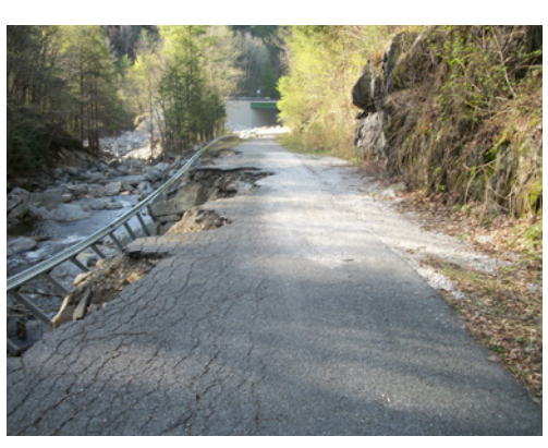
Post-Irene washout of sections of Black Brook Road rendered it nearly impassable.

With the steep roadway embankment susceptible to scour, a conventional cast-in-place concrete wall system was not feasible. Weston & Sampson's innovative stabilization design