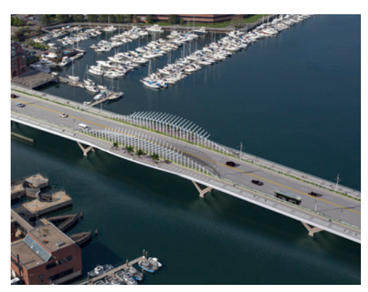
Rendering of final bridge design with existing Charles River Dam in lower left

A 285 ft. long by 33 ft. high architectural trellis will be constructed in barrier/planters that will mark the center of the navigation channel crossing and will extend up to 26 ft. over the bicycle lane and widened sidewalk to provide partial shade. The architectural trellis will be illuminated with accent lighting visible from the water and banks. The overlooks, benches, trees, information panels and the architectural trellis will create a unique destination that is separated from vehicular traffic and accessible for use by people of all ages and interests.