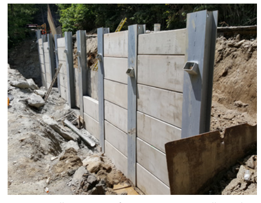
Lagging wall consisting of pre-cast concrete wall panels and soldier piles stabilize the embankment.

The repair of Black Brook Road was important to the town, surrounding communities, and emergency response services within Savoy. Rebuilding and restoring Black Brook Road provided social, economic, and sustainable benefits to the town, but the social considerations were the most critical. The town needed the road fixed to restore this vital connection between Savoy and neighboring towns that was severed