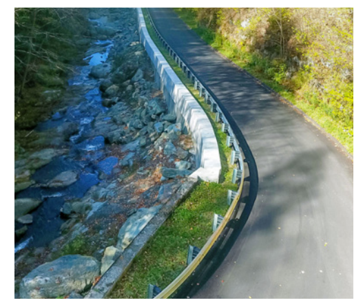
Restored roadway and supported embankment renders it resilient against climate-change induced extreme storms.

by storm damage; reduce the lengthy travel time to the store, nearby restaurants, health services, work; and, more importantly, reduce the response time of detoured emergency vehicles. With many residents aged over 60, waiting 45 minutes for help to arrive is unacceptable and life-threatening. This reconnection project restored emergency and routine access to residents in previously cut-off areas of town.