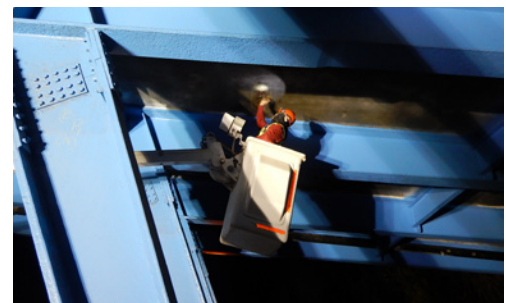
Aniket Mahajan performing a nighttime inspection of a Steel Multi Beam K-Frame carrying Middle Road over Route 4 in East Greenwich, RI

in the office where all the bridge plans, live load rating materials, and bridge historical data can be used for reference.