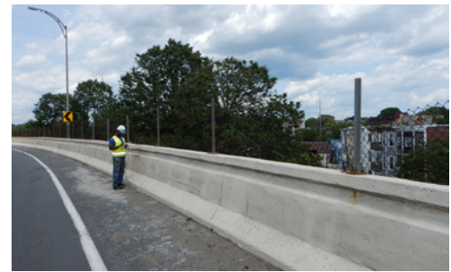
Harold Ntiamoah performing a top of deck inspection on the elevated portion of Route 1 (northbound) over Arlington Street and Fifth street in Chelsea, MA

It is interesting to note that collision or damage related inspections function in exactly the same way. Each of these items are investigated during the inspection and may need to continue back