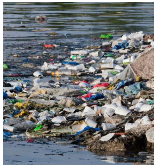
55% of our nation's rivers and streams, along with 68% of lakes (by acreage) do not support healthy aquatic life.

To add further to the funding need, local and regional water/wastewater treatment systems are having to comply with more regulations that include more stringent drinking water standards and those related to climate change and sustainability. Federal funding accounts for roughly 30% of the funding for water infra-