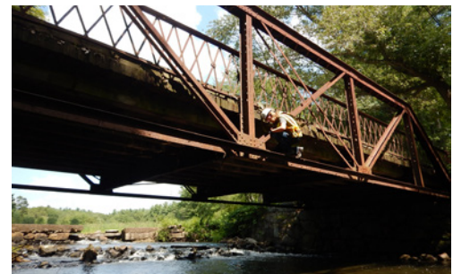
Peggy Seabright inspecting a truss bridge along Howard Road over Abbott Run in Cumberland, RI